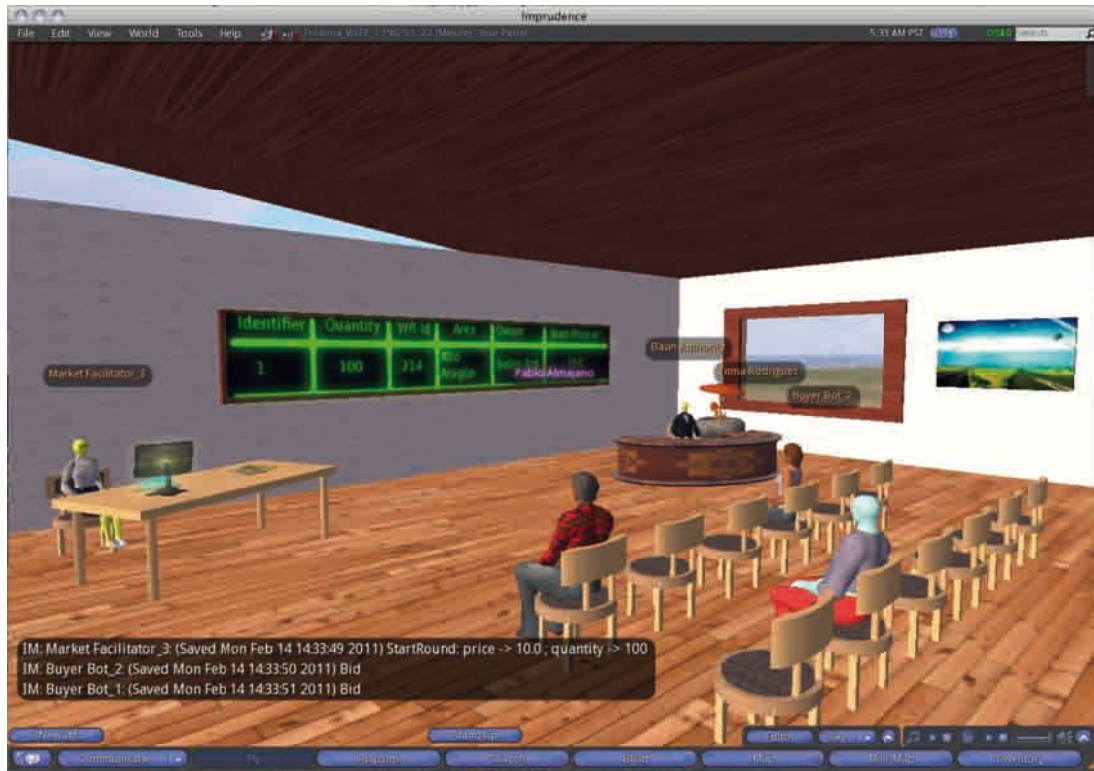
Figure 2 Snapshot of a Virtual Institution execution.

every day. Such immersive and interactive environment provides many possibilities to represent the system state and the regulations defined by the coordination model. For instance, the other participants are represented also as avatars and their appearance can be used to display the role they are playing. We argue that 3D virtual worlds can be successfully used to incorporate humans into MAS. To illustrate this hypothesis, next we outline the work carried out to open electronic institutions to humans by using virtual worlds.